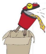
A dragon in the classroom